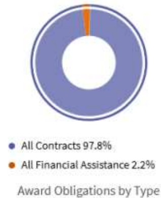
Award Obligations by Type

How much has this agency planned to spend on awards? $423.88 Billion in award obligations 35.6% of total obligations