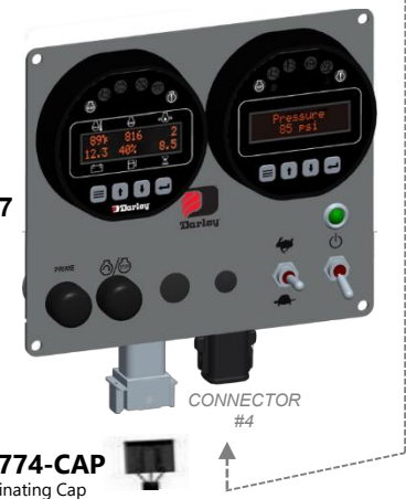
MVP-M1117 Remote Panel

TERMINATING CAP REQUIRED FOR PROPER OPERATION