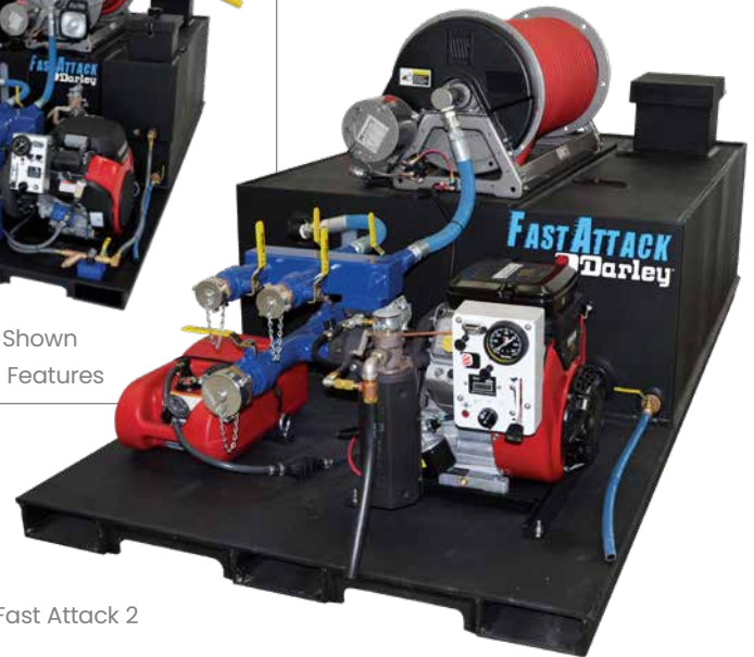
Fast Attack 2