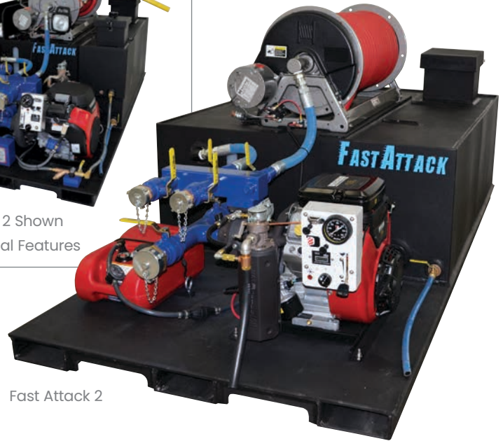
Fast Attack 2