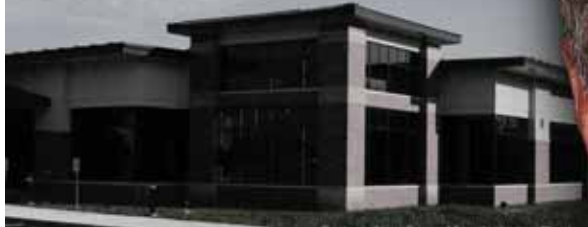
Darley's New Pump Manufacturing Plant Dedicated in 2003 to Bill Darley

"A legacy isn't just something you leave behind, It's something you build every day you live!"