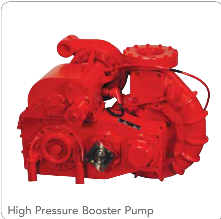
High Pressure Booster Pump