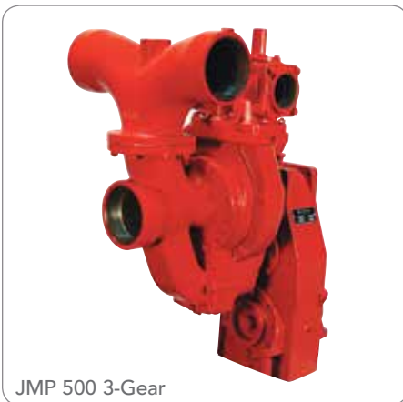
JMP 500 3-Gear