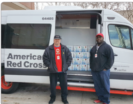
RED CROSS USES SAFE WATER BOX FOR DISASTER PREPARATION