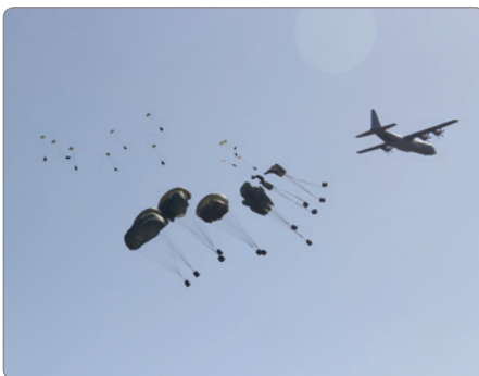
PALLETS AIRDROPPING VIA CARGO PARACHUTE

CONTACT KEVIN SOFEN AT KEVINSOFEN@DARLEY.COM • 630.735.3538 WWW.SAFEWATERBOX.DARLEY.COM