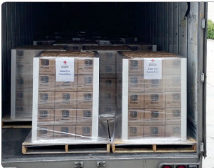
EACH PALLET CONTAINS 80 BOXES - 211 GALLONS OF WATER