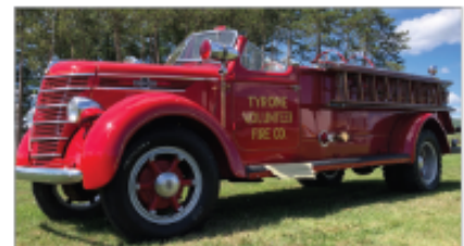
1939 American LaFance restored

Photos are of apparatus builders that we believe are no longer in business.