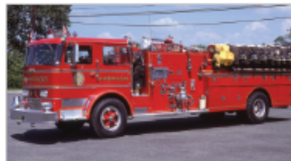
1961 Duplex Howe

Photos are of apparatus builders that we believe are no longer in business.