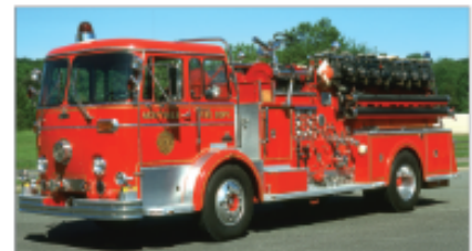
1966 Crown