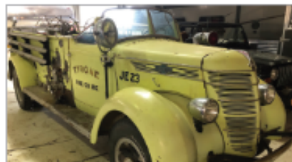
1939 American LaFance

categories that were reviewed. As expected, the 1966 membership consisted of only major component companies.