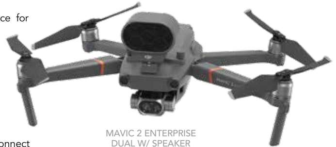
MAVIC 2 ENTERPRISE DUAL W/ SPEAKER

Unlock the possibilities of flight with an extended port that allows you to connect additional devices onto the drone, helping you perform at your best in a variety of daily and critical missions.