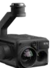
H20T SIDE FACE