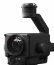
H20 SIDE FACE