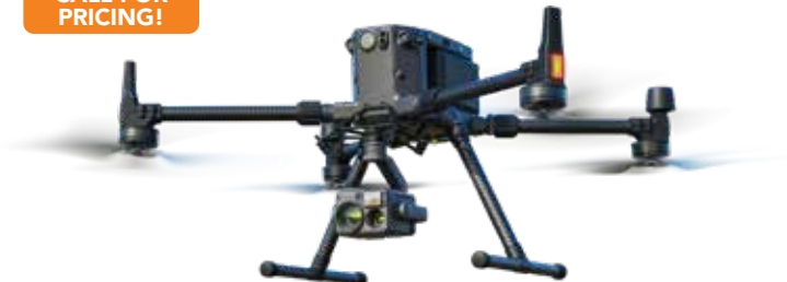
MATRICE 300 RTK