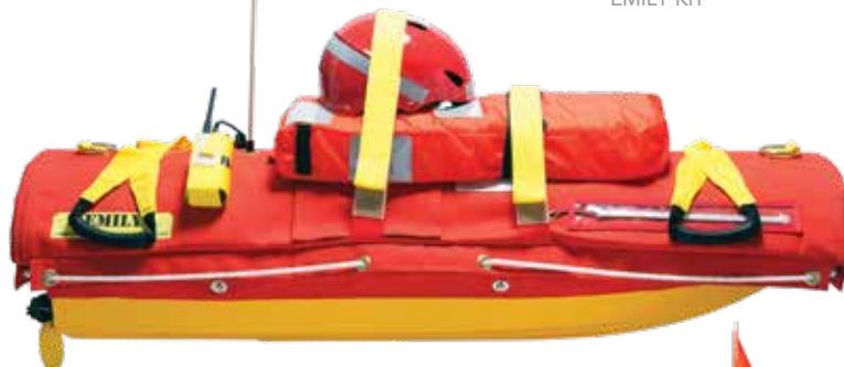
SWIFT WATER EMILY