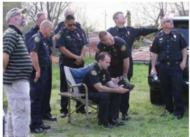
CUSTOM TRAINING CLASSES