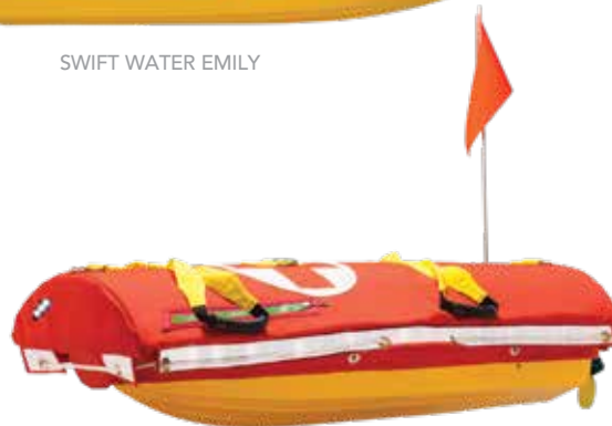
MAN OVERBOARD EMILY KIT