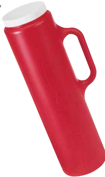
AH002 Flare Container

Keep your flares together, easily accessible and safe from damage. Flare Container can hold up to twelve 30-minute flares. Easy to open cap and large handle make it user-friendly. It's so inexpensive, one can be kept in every vehicle. Ship. wt. 1 lb.