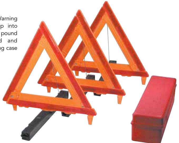
P639 Three-Triangle Vehicle Warning Kit

No flares or electric flashers are necessary with the Vehicle Warning Kit. The kit includes three fold-out reflective triangles that snap into position in seconds. Each triangle is attached to a heavy four pound weighted base. Made of tough plastic with reflective red and fluorescent orange on both faces. Comes complete with handy carrying case for easy storage. Ship. wt. 15 lbs.. Ship. wt. 15 lbs.