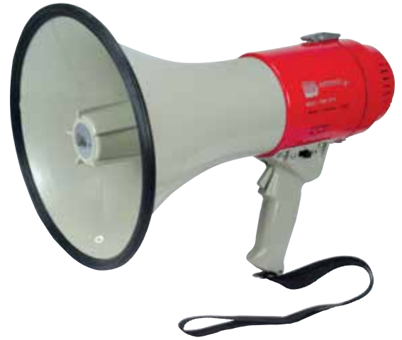
BH058 Lightweight Megaphone