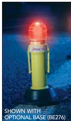
SHOWN WITH OPTIONAL BASE (BE276)