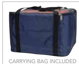
CARRYING BAG INCLUDED