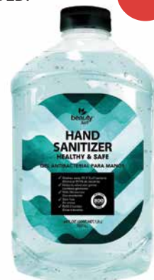
BP341 Speedbox Hand Sanitizer