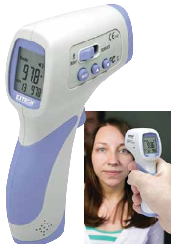
BP309 Extech IR200: Non-Contact Thermometer