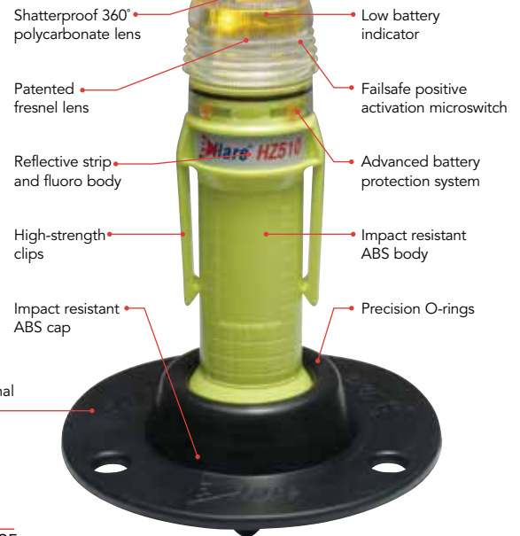
Detachable optional base (BE276)