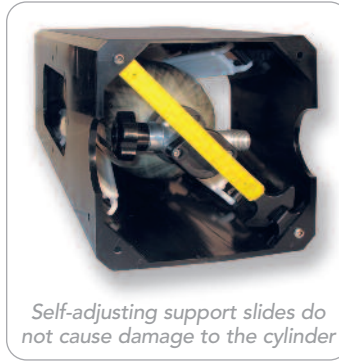
Self-adjusting support slides do not cause damage to the cylinder