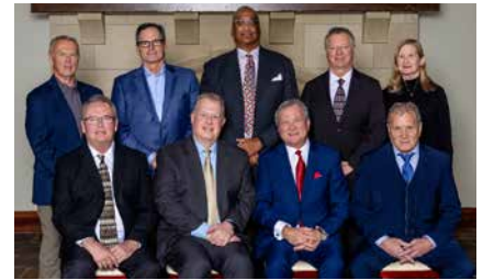
Darley's Board of Directors.