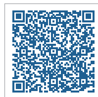
Learn More shop.darley.com/essay-competition

Your voice matters. Help drive the conversation forward by submitting your essay.