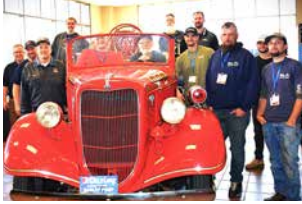
Fall 2024 Pump Academy graduates.

Our tuition-free Pump Academy provides comprehensive knowledge ranging from pump theory to hands-on maintenance and repair of Darley pumps and accessories. To keep up with ongoing advancements, we advise OEM service centers to participate at least once every five years. Sign up today www.darley.com/pump-academy