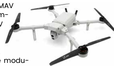
Proudly engineered and manufactured in the USA. NDAA and RID compliant.

Darley has teamed with EchoMAV to offer a distinctive NDAA compliant drone option. EchoMAV is designing, building, and creating solutions for unmanned systems. The MONARK is a lightweight, highly-packable modular quadrotor UAS designed for ISR and delivery. Unique in its class, the MONARK offers a 3D-printed aircraft designed to be field repairable and upgradeable by the end user. Contact uxs@darley.com to find out more. 📄