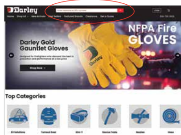
Experience the new & improved shop.darley.com search feature.

Experience the difference yourself on shop.darley.com