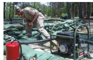
Ohler 150 GPM fuel/water pump.

While Ohler Pump has many initiatives focused on innovative new systems, fuel and water transfer pumps are at our core. Ohler provides our DoD customers with a full range of portable fuel and water pumps. From 20 gallons per minute to 1,200 gallons