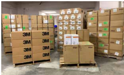
Darley's Los Angeles fire donations.

Darley was honored to support the brave volunteers and evacuees affected by the Los Angeles wildfires. Darley donated 35,000 N95 masks to aid in the relief efforts, ensuring the safety and well-being of those on the front lines and those displaced by the fires, as well as making a $5,000 donation to both the California Fire Foundation and the Los Angeles Fire Department Foundation.