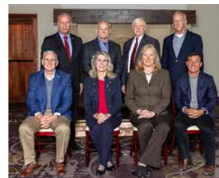
Darley's Defense Advisory Board (DAB) members.

Darley held a fantastic Defense Advisory Board meeting in December concentrating on six focus areas: 1) Diversifying our lines of business, 2) Capitalizing on emerging markets, 3) Growing profitably, 4) Handling the complexities of compliance, 5) Approaching foreign military sales and 6) Differentiating ourselves in the accelerating unmanned systems market.