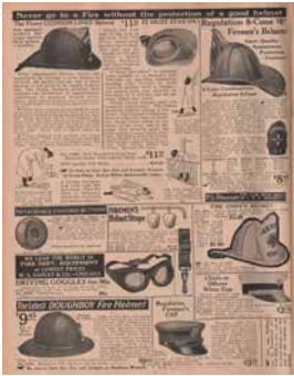
Page four from Darley's 1943 catalog.

The headline read "Never go to a Fire without the protection of a good helmet." That advice still rings true today with head gear becoming more sophisticated and durable. See all our equipment options on shop.darley.com