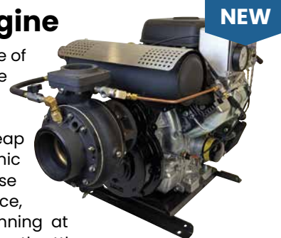
Power and efficiency combined in the new 40 HP Vanguard EFI+ETC engine.