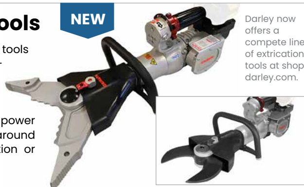
Darley now offers a complete line of extrication tools at shop.darley.com .

Darley has recently partnered with Edilgrappa to promote a line of rescue tools and we're looking for dealers who would be interested in promoting and partnering with us. These rescue tools have been manufactured by a family run business in Italy since 1977. This complete line of tools are NFPA certified, budget friendly, light weight and battery operated. Whether you're a professional rescuer or part of an emergency response team, these tools offer the power and versatility needed to handle the toughest challenges by rescue teams around the world. Please reach out to ryandarley@darley.com for pricing, information or to become a dealer and part of our team.