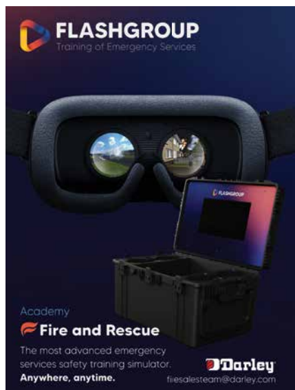
Virtual reality system for first responders.