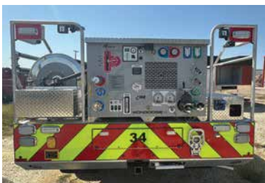
The FAA's new test truck sold by Travis Ownby, of Skeeter Emergency Vehicles equipped with a Darley Mongoose.

Mounted on a rugged Ford F-550 chassis, the truck is configured as a Skeeter EV Quick Response Vehicle, optimized for both mobility and functionality. Equipped with a Darley Mongoose, 500-pound dry chemical system, along with water and foam capabilities, the vehicle provides a versatile platform for evaluating flow rates, GPM, and foam expansion using CAFS. With Skeeter's reputation for building durable, high-performance fire apparatus, this new test truck is set to be a valuable asset in the FAA's ongoing mission. 📄