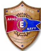
Darley's prestigious Army/Navy E award.