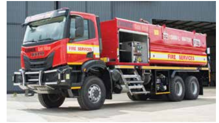
Darley LSP 750 pump powers Cobra's Inkosi MS fire tanker.

Backed by Darley's innovation and support, Cobra's Inkosi MS (Zulu for "King") 6x6 fire tanker features a Darley LSP 750 centrifugal pump, Trident Foamate ATP 1.5 Class-B foam proportioner, Elkhart Sidewinder deck monitor, electric rewind hose reel 25 mm x 30 m (1" x 100') with 15,000 ltr. (4,000 gal.) water tank and 1,000 ltr. (260 gal.) Class-B foam tank. Cobra's ongoing partnership with Darley has been pivotal to their success in the industry, bolstered by the addition of Darley's comprehensive range of firefighting and rescue equipment. Cobra Projects, is based in Johannesburg, South Africa and engineers cutting-edge municipal, mining and industrial fire and rescue vehicles, serving clients across the African continent. Contact Cobra Projects to learn more www.cobraprojects.com/contact-us 🍷