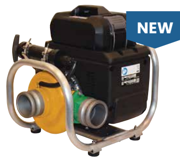
2BE2.4H-E pump, powered by the Honda EGX electric motor.

Darley introduces the 2BE2.4H-E pump, powered by the Honda EGX electric motor. This innovative pump, currently being tested by the US Coast Guard, offers solid performance, durability, and ease of use. In testing it was able to deliver nearly 6000 gallons of water on a single charge, eliminates the need for gasoline, and reduces emissions. The pump's robust design ensures long-lasting service, and its user-friendly interface allows rapid deployment. The shift to an electric motor aligns with Darley's commitment to sustainability. Visit our pump page at darley.com/pumps .