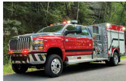
Quick delivery on Darley's agile Tactical Pumper featuring 1500 GPM and CAFS.

Fire Departments across the U.S. commonly state, the Tactical Pumper's capabilities support 90% of their calls and costs less than half the price of their traditional engine. With an easy to operate 1500 GPM pump & CAF system, Darley's Tactical Pumper ensures efficient, effective water utilization and enhanced fire suppression capabilities.