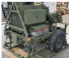
Ohler 350 GPM fuel/water pump.

per minute, multi-fuel diesel engine driven to DC motor driven, skid mounted to trailer mounted, Ohler is meeting the needs of the war fighter. If you have a need to move fuel or water, we are here to assist, contact robertbond@darley.com 📄