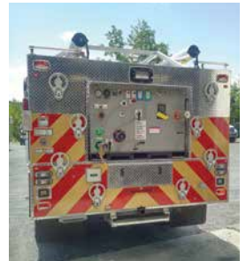
The UHP offers ultra high pressure and high volume.

This system allows for the simultaneous use of 8 gpm Ultra High Pressure (UHP) with foam for tackling wildfires, while still offering an impressive 160 gpm @ 80 psi for pump and roll — both pumps powered by a single engine. As wildfires encroach on urban areas, the UHP-HV system by Darley is an ideal solution for maintaining safety and readiness year-round. 🍷