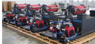
Darley's Fast Attack skid units.

The Cook County Forest Preserve District of Illinois recently took delivery of four (4) Fast Attack Skids equipped with Darley 2BE21H multipurpose pumps.