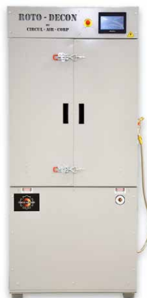
Circul-Air Roto-Decon SCBA Washer.

Explore Circul-Air's expanded product line, and find these industry-leading solutions in the new Darley catalog or visit our website at shop.darley.com/category/circul-air