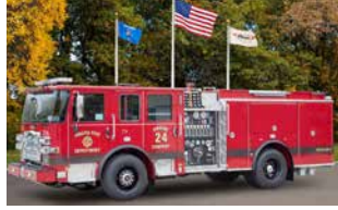
Proven reliability and trust, Omaha Fire Department switches to Darley's PSM 1500 pump.