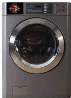
Circul-Air express soft mount extractor.