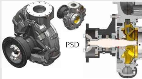
Direct drive pump capable of: 1000 gpm and 1250 gpm NFPA ratings thru 1-6" 1500 gpm, 1750 gpm and 2000 gpm NFPA ratings thru 2-6".

Most are unaware that PTO manufactures today no longer limit some of their PTO output speeds to 2500 rpm anymore. With a newly allowed 4000 rpm PTO output speed, Darley PSD 1500 fire pumps can easily attain a 750 gpm at 250 psi performance point with plenty of safety margin left on the engine's governed speed.