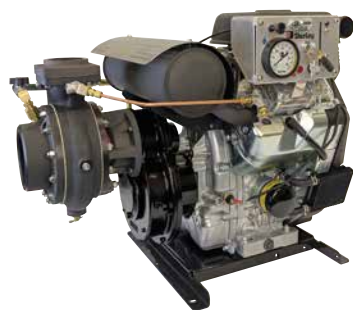
The HGE40V features a new and improved control panel.

Multiple Pump End Options - To cater to diverse operational needs, the new 40 Horsepower Vanguard engine is available with three respected Darley pump options, the 1.5AGE, 2.5AGE, and the HGE. These pump end options cater to a wide range of operational requirements whether it's fighting fires, water transfer, or site cleanup. Furthermore, Darley's commitment to innovation and quality guarantees that this engine will exceed the expectations of even the most demanding professionals. Visit our pump page at darley.com/pumps .